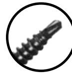
SIPLD Light Duty - Drill Point for Corrugated Steel Deck & Wood Applications