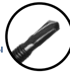
SIPHD Heavy Duty - Drill Point for Thick Steel Member Applications