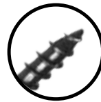
SIPTP Thread Point for Wood & Timber Applications